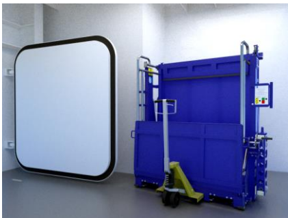
Folded together and stowed